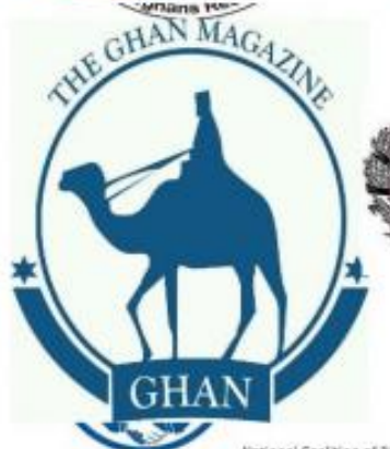
Islamic revolutionary movement for the prosperity of Afghanistan