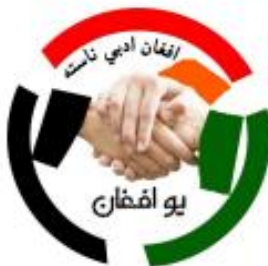
Afghan library association