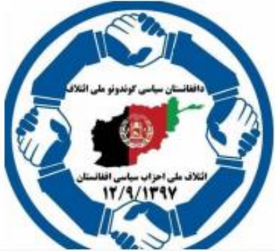
National coalition of political party of Afghanistan